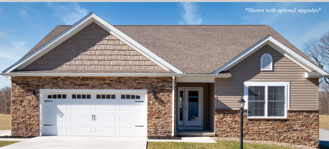
*Shown with optional upgrades*